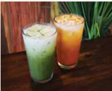
Thai Iced Tea/Green Tea