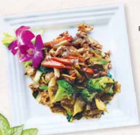
Pad See Ew