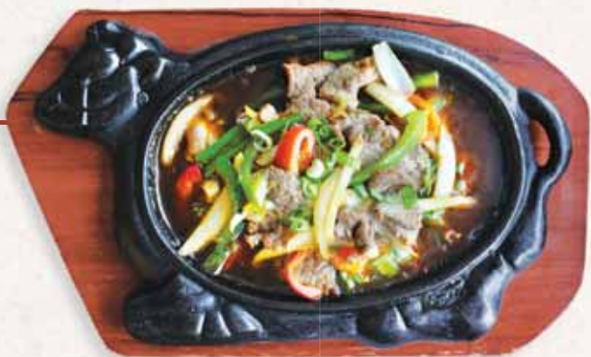
Beef Oyster Sauce