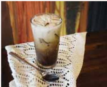
Thai Iced Coffee