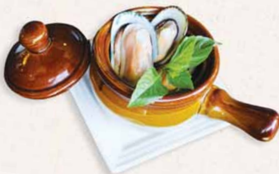
Hoi Ob Lemongrass