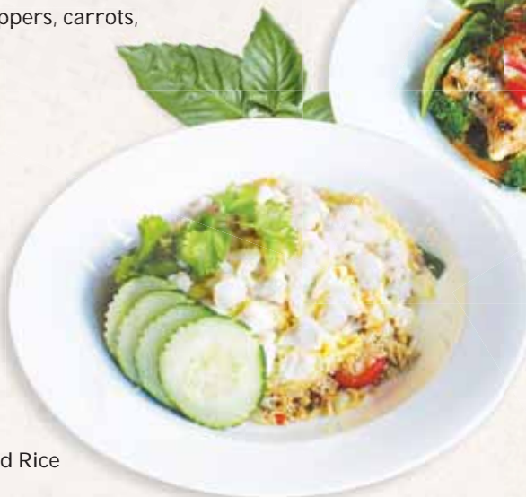
Crab Fried Rice