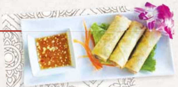
Thai Spring Rolls

Cabbage, carrot, celery and clear noodles wrapped and deep fried, served with chili sauce