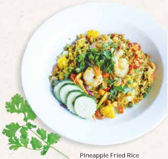
Pineapple Fried Rice

Pineapple, egg, carrots, onions, peas, cashew nuts, tomatoes with yellow curry powder