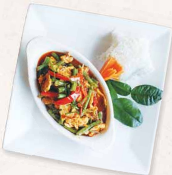
Pad Prik King