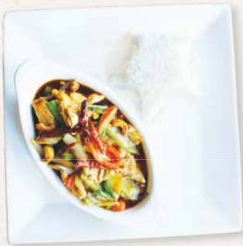
Pad Cashew Nut

Carrots, onions, bell peppers,celery, scallions, with curry powder