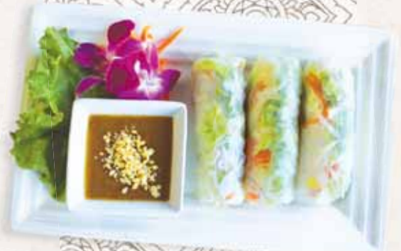
Thai Summer Rolls

Carrot, lettuce, and vermicelli noodles wrapped in rice paper, served with peanut sauce